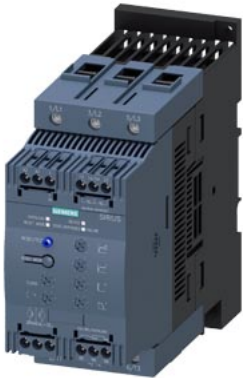
SIRIUS soft starter S3 106 A, 55 kW/400 V, 40 °C 200-480 V AC, 110-230 V AC/DC Screw terminals